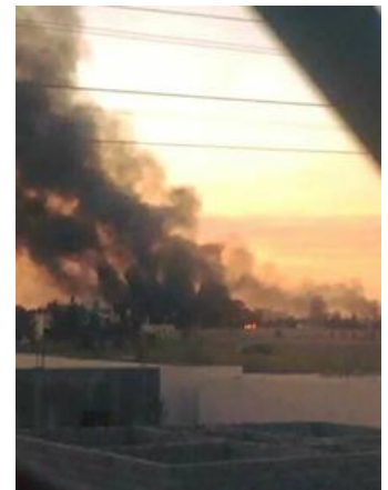
Clashes on 02/08 in Tripoli

Security / Tripoli: New armed clashes were reported on the afternoon of 02/08 in the South of Tripoli, in the area of Abusalim, Salaheddin and Habdah between Misrata armed militias (close to K.Ghwell) and Gneiwa armed militias (close to GNA). While the day of 02/09 remained relatively calm, sporadic clashes happened again the night between 02/09 and 10. The situation then progressively normalized.